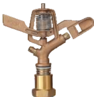
Female Threaded ( AQ-25F )